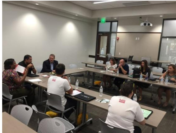
Photo 8. Discussion about possible cooperation

Meetings on possible future cooperation and joint projects have come today. They got acquainted with how interdisciplinary studies, summer schools and international cooperation work. Various interesting discussions and ideas emerged about possible student exchange and participation in summer schools. After all the meetings we went on a tour of the University. Among other things, we visited the student union building where we saw their rooms for designing and realizing their entrepreneurial ideas.