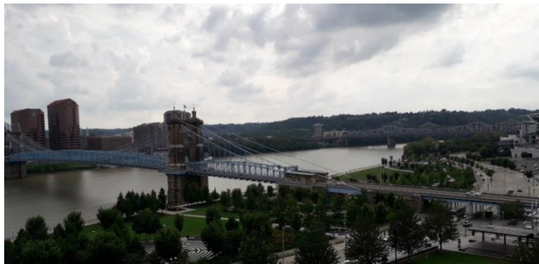
Photo 5. The view from the roof of the hotel on the river

Today we explored local culture with Assistant director of McNair program UC. We went to a baseball stadium called „ Great American Ball Park “ where we bought a souvenir of their club Cincinnati Reds. After that we went through a beautiful park full of flowers and fountain, all the way to the „ Ohio River “. After visiting the park and enjoying the sounds of water and the scents of flowers, we moved to the roof of the hotel where we had a wonderful view of the river, bridges and part of the city. At the end of the day it has started to rain and we decided to spent the rest of our afternoon in the restaurant trying American food.