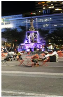
Photo 2. Fountain on square in Cincinnati