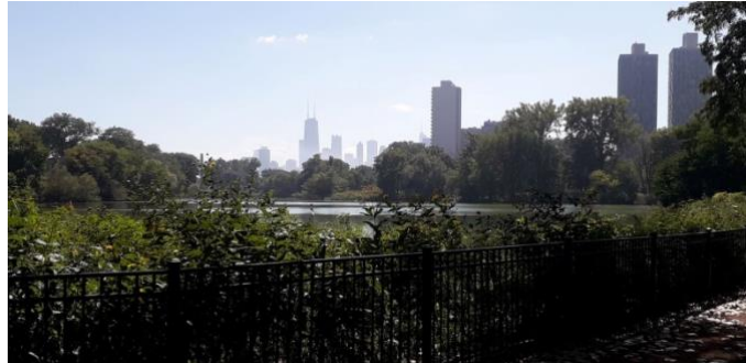
Picture 14. Lake at Lincoln Park

We came to Croatia on Monday during the afternoon so our adventure ended. And at the end of this wonderful story, I would like to thank everyone who worked and enabled my colleagues and me to participate in this International Exchange of Students, enabling me to develop new skills and acquaintances.