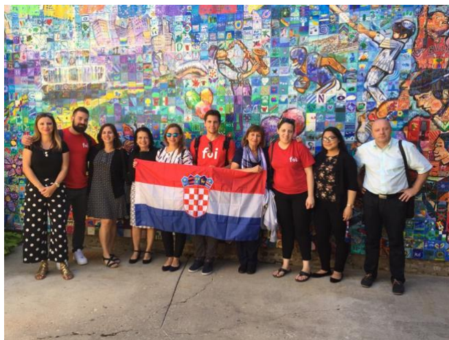
Photo 10. Group photo at the premises of El Valor

University Buildings where we met a professor from the Department for People with Disabilities and Human Development. Together with him we have listened to a couple of presentations with a topics about how and where people with disabilities can ask for help, and at the end of the lecture we took us to workshops where new ideas and stuff for people with disabilities are being developed. We ended the day with a tour and learning about cultural in the Chicago Center and visiting the Millennium Park.