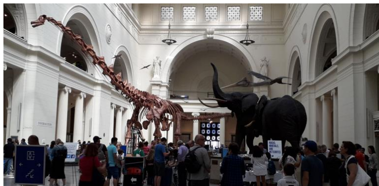
Photo 13. Lobby at The Field Museum

Saturday was reserved for visiting The Field Museum. In the museum we could go through whole past and the evolution of earth. The museum had a main exhibition and a few additional exhibitions. From other exhibitions I chose the mummies. Today's activity was also writing short descriptions about the observations and events on this trip.