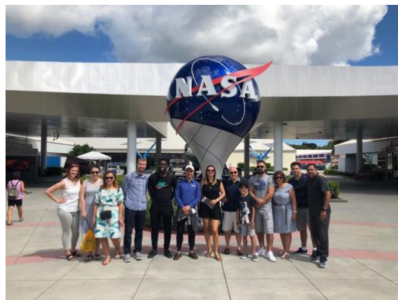
Photo 7. Kennedy Space Center