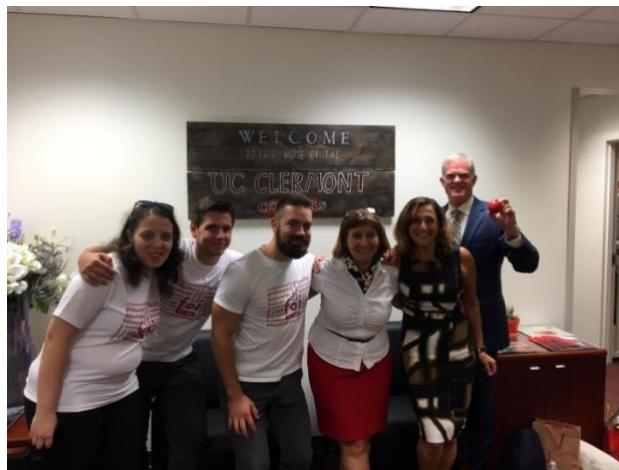
Photo 3. Photo with dean of Clermont College UC