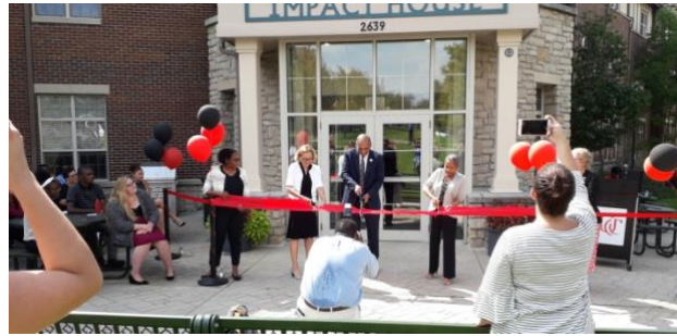
Photo 4. Cutting the rope during opening