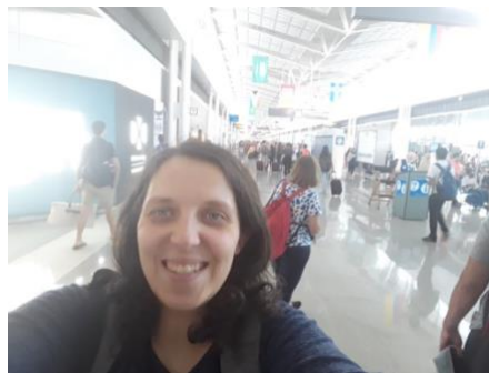
Photo 1. Dulles airport

In early morning hours we left Franjo Tuđman Zagreb airport towards Frankfurt where we arrived at the scheduled time. During check-in in Frankfurt my adventure has begun. I was picked by airport security for a random safety search. That's the first time I experienced something I saw only on documentaries about border protection. Everything went well and we continued toward Dulles in Washington. When we arrived, our flight to Cincinnati was canceled, so we spent the night in hotel in Dulles.