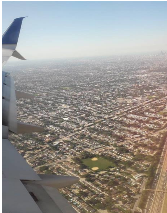
Photo 9. View of Chicago from the plane

We spent the morning hours in the final preparations for going to Chichago. At about noon, we all went all the way to the airport in Orlando where we waited plane for the Chichago. The flight was short, but our trip to the hotel was long. Chichago is a big city with a lot of cars and big crowds of traffic. In the hotel we had been welcomed by the assistant director of the McNair program at DePaul University. After we settled in the hotel we went to dinner with the director of the MCNair program DePaul and his assistant.